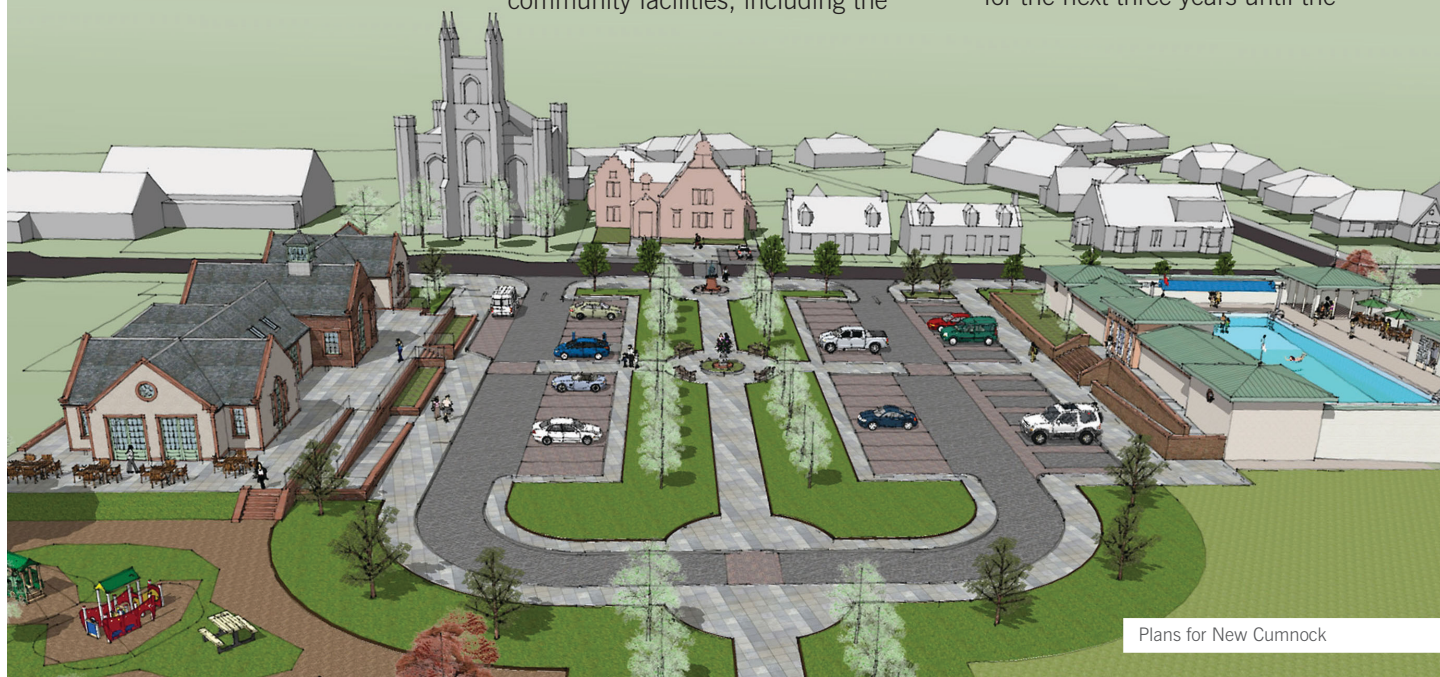
Plans for New Cumnock

The games hall will continue to be run by East Ayrshire Leisure Trust for the next three years until the